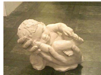
"Loving Hands of Mercy"

"LOVING HANDS OF MERCY": We are pleased to announce that the "Loving Hands of Mercy" garden statues (shown below) will again be for sale at Kelly Anne Growers, 5913 Avon Belden Road, N. Ridgeville. (440) 327-0404. There are two sizes available. The larger size is $29.99 and the smaller size is $25.99. All proceeds from the sale of the garden statues are donated to Lorain County Right to Life.